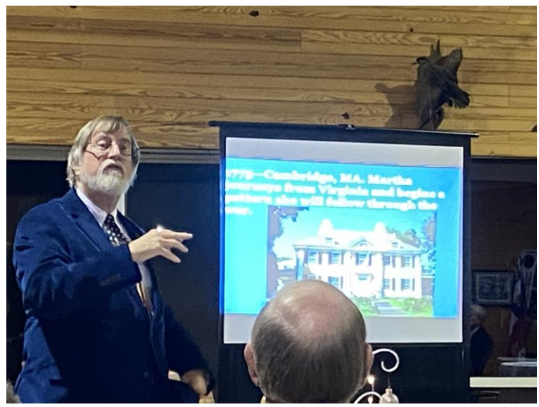
"East Fall Line Region compatriots attend Fort Morris Event"