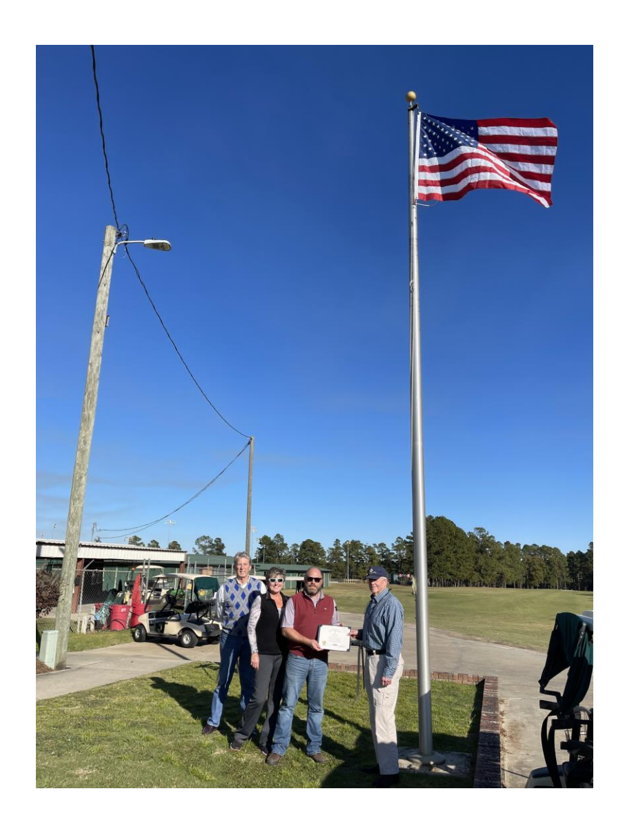
"Brier Creek Revolutionary War Battlefield Association, Inc Signs agreement with Georgia Department of Natural Resources, Wildlife Resources Division"

"The Brier Creek Revolutionary War Battlefield Association, Inc (BCRWBA). and the Georgia Department of Natural Resources, Wildlife Resources Division (WRD) have signed an "historic" agreement to work together to preserve the Brier Creek Revolutionary War Battlefield located on the Tuckahoe Wildlife Management Area.