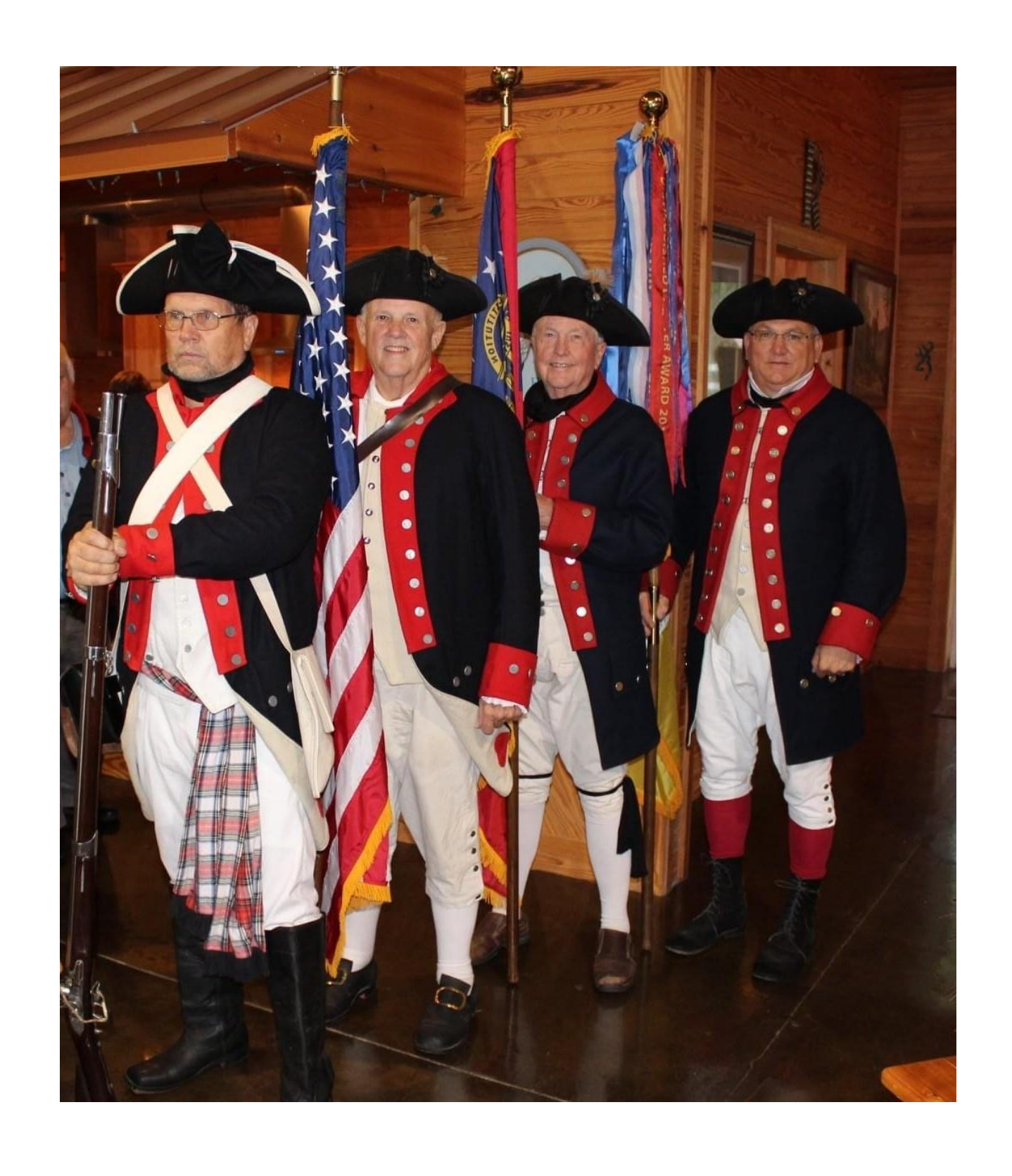
"Second Siege of Augusta Event held"