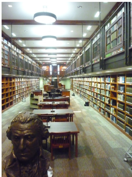
SAR Genealogical Research Library

Each society (made up of numerous chapters) is equal to and independent of other societies, though all still fall under national SAR guidelines. Societies hold annual meetings to set goals and benchmark their achievements, as does the National Society.